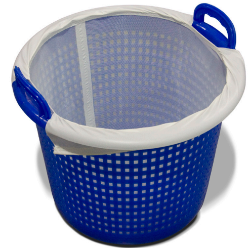
Basket with Liner Installed