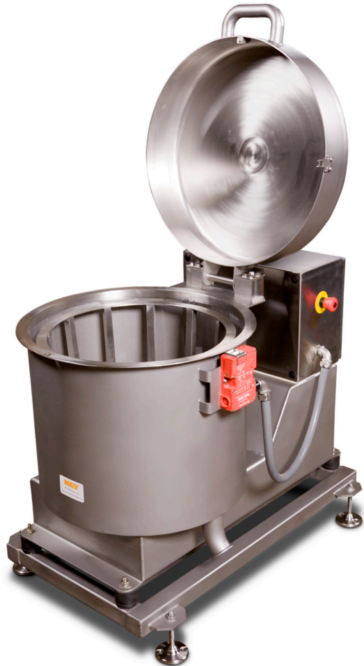
Compact Fresh-cut Dryer with lid open

Key's Compact Fresh-cut Dryer provides a flexible solution for removing water from a wide range of fresh-cut produce, enhancing your product quality and extending shelf life. Simple and efficient, the centrifugal design provides adjustable speed and time settings to optimize drying for leafy greens, cut vegetables, and herbs. Solid and dependable, the Compact Fresh-cut Dryer functions perfectly with Key's Fresh-cut Basket Wash and AVSealer Packaging and Sealing Machine to give you a full processing and packaging solution.