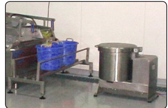
Compact Fresh-cut Dryer used together with Key's Wash System