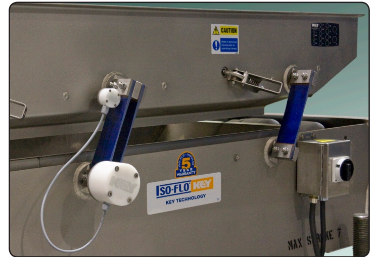
SmartArm® Installed on an Iso-Flo®