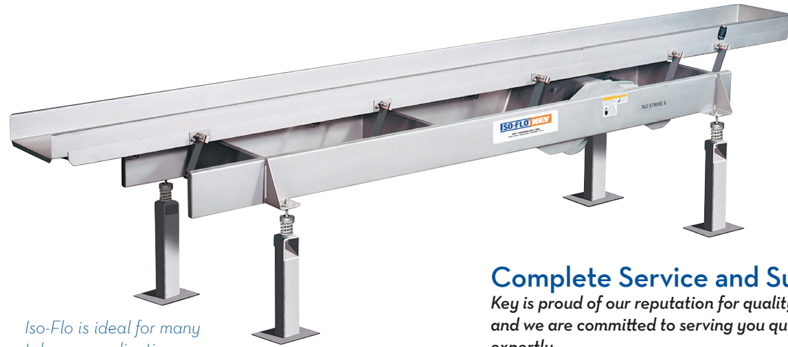
Iso-Flo is ideal for many tobacco applications