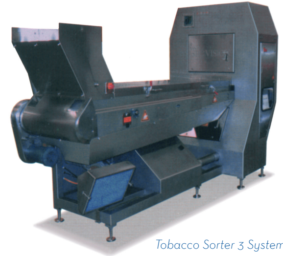
Tobacco Sorter 3 System

Operation is simple, and sorting criteria are easy to adjust, store, and retrieve, so sorting is stable and objective.