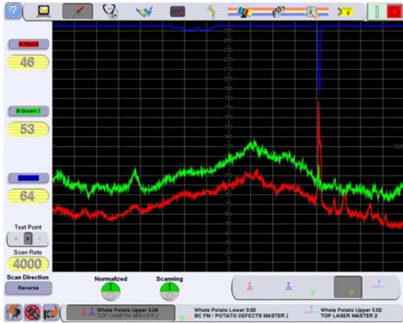
Dirty Bottom Camera Window

of least resistance. If the product is wet, mist travels with the ejector airflow and if the product is extremely dry, dust can be generated and carried with the airflow. Without proper planning, the airflow could cause mist or dust to collect on camera windows or other surfaces, which would degrade the sorter's performance or create sanitation issues. Ideally, the sorter's outfeed design allows the ejector airflow to travel out toward the rejected product stream or the good product stream.