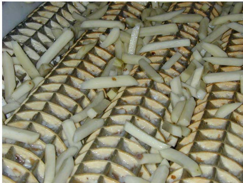
Rotary Sliver Remover

To further improve the sorter's performance, reduce, as much as possible, the objects in the product stream that are not good product. For example, when producing potato products, it is important to remove slivers and fines upstream of the sorter by using shakers with screens or rotary sliver removers. An example of this is when peeled potato products are being produced, take steps to maximize the effectiveness of the scrubber to remove all loose peel. For products conveyed in water, dewatering prior to sorting minimizes the "optical noise" caused by water.